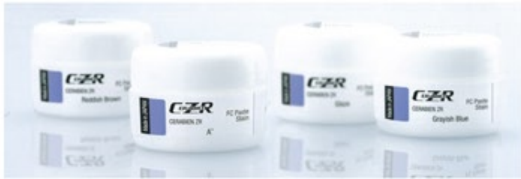
The FC Paste Stain color composition list

Noritake have added a new paste-type FC Paste Stain (a surface stain) to their Cerabien ZR line, which lets you characterise full-zirconia restorations with the greatest of ease. FC Paste Stain is available in a total of 27 shades including a fluoro shade giving you more variety over the shades in use.