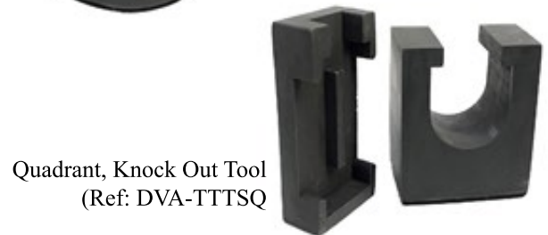
Quadrant, Knock Out Tool (Ref: DVA-TTTSQ)