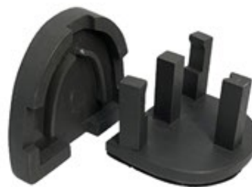
Full-Arch, Knock Out Tool (Ref: DVA-TTTSFSPI)